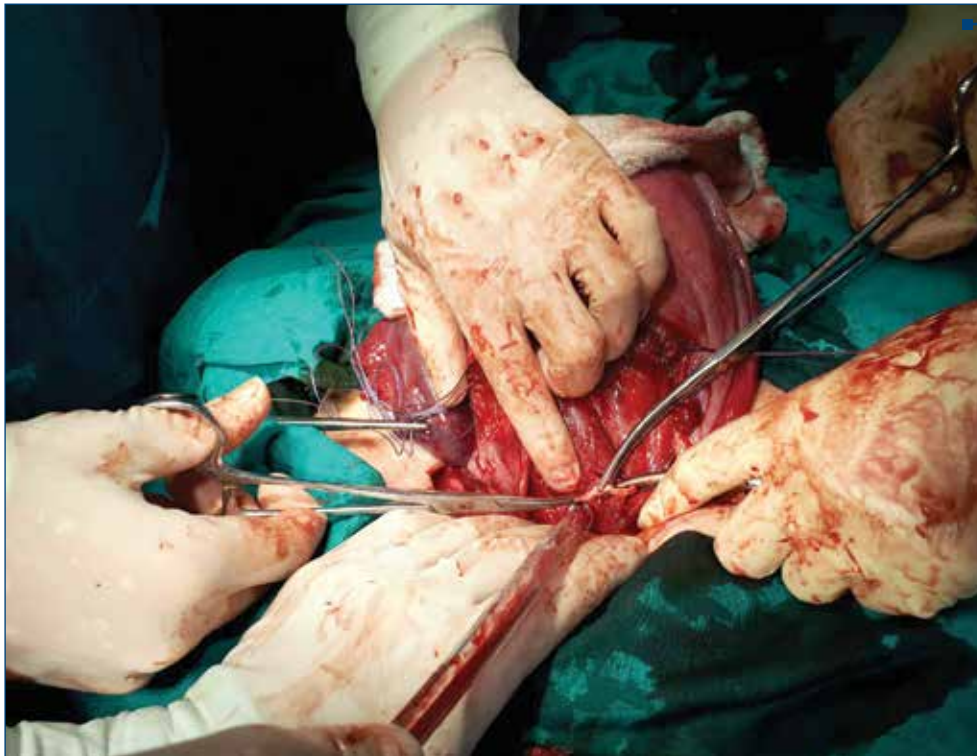
Figure 2. The intraoperative aspect of the band used for the prophylactic transabdominal cerclage (anterior view)