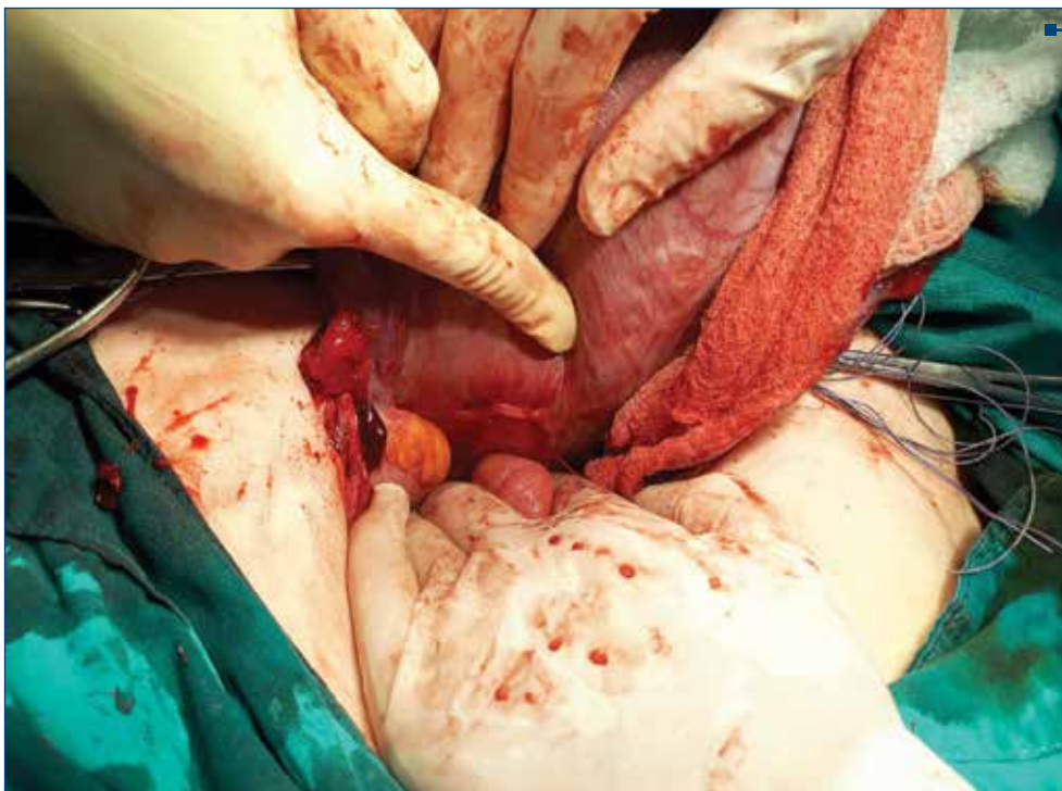
Figure 1. The intraoperative aspect of the band used for the prophylactic transabdominal cerclage (posterior view)

The usual cure for women at risk for cervical disease is a transvaginally cerclage. Mc Donald's procedure is often used, while Shirodka's technique is performed in selected situations (7) .